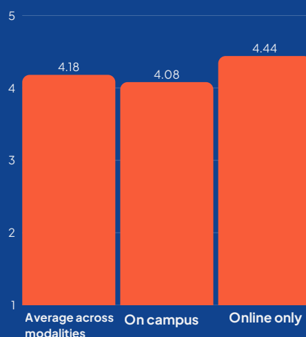
Student satisfaction (out of 5)